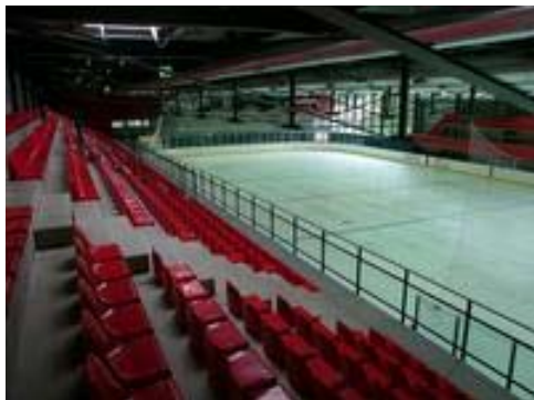
The Palladium stadium in Champery

While Baselga is finalizing its preparations for this event, Champery's organizing engine is in motion for the next STAR CLASS COMPETITION - October 20 th -21 st which will see on the ice the 'Starclass', Junior A and Senior categories.